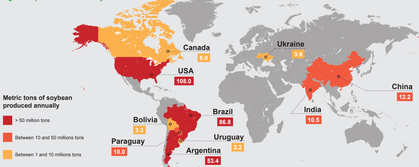
Figure 1 Top Ten Producers of Soy <sup>6</sup>

through products like soy sauce, tofu and tempeh.<sup>2</sup> Most soymeal (over 90% in the EU<sup>3</sup>) is used for animal feed. Other uses of processed soy include as cooking oil, a source of protein in meat and dairy substitutes, and an ingredient in many processed food products. A recent estimate suggests that soy derivatives are used in the production of 60-70% of all global supermarket products.<sup>4</sup> Similar to palm oil – or perhaps even more so – soy is often an 'invisible' ingredient in many consumer products. The "way soy is embedded in the food system has meant that consumer-facing firms have been shielded from the externalities of its production and trade to a much larger degree than parallel commodities".<sup>5</sup>