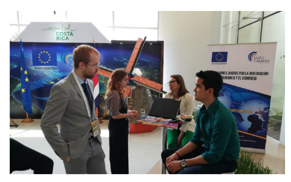
Event Buyers Trade Mission in Costa Rica.

EU-funded programme's two-track focus builds the institutional capacity of the Central American Integration System and showcases EU activities that support regional integration and cooperation between Europe and Central America.