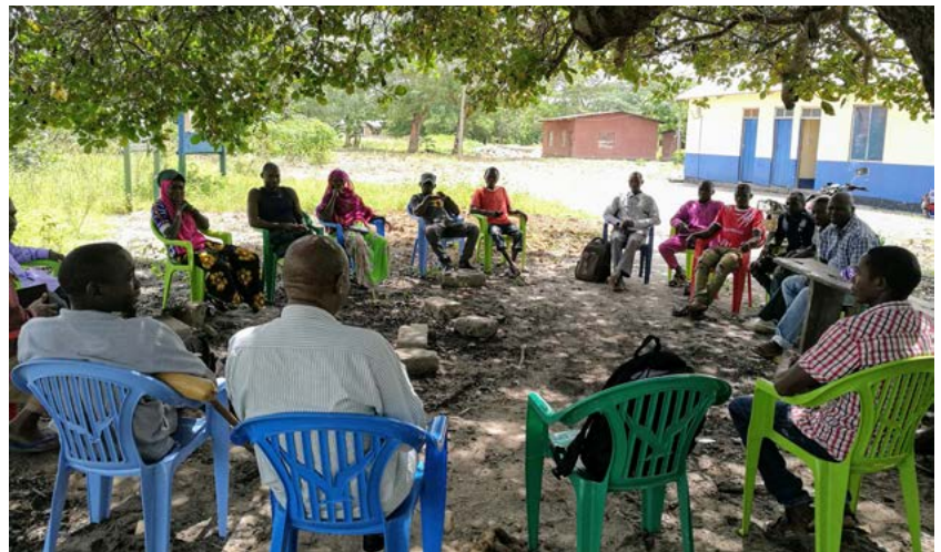
Part of the Evaluation of Agriculture, Rural Development and Forest Sector Programmes in Africa, a village consultation took place in the southern highlands in Tanzania, which related to the Mtwara Agribusiness Support (LIMAS) project.