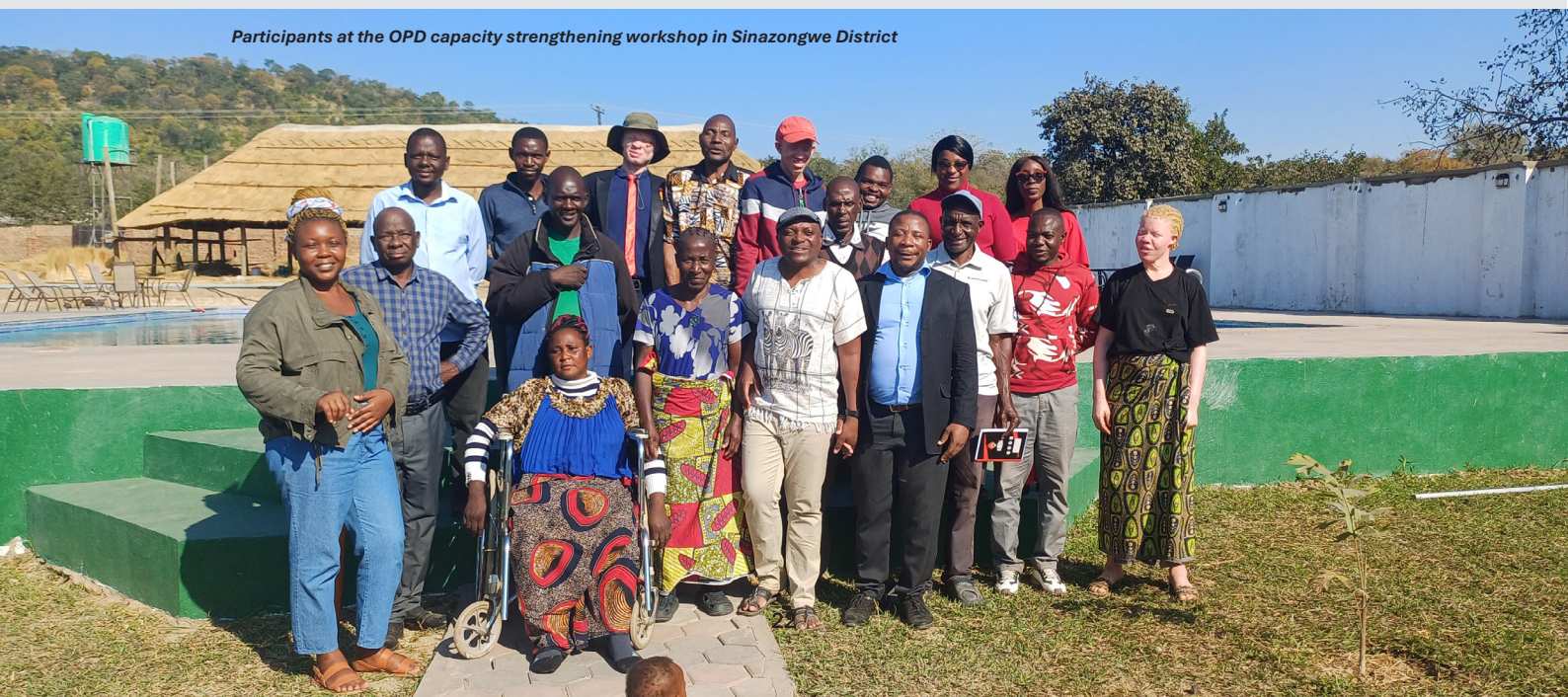
Participants at the OPD capacity strengthening workshop in Sinazongwe District