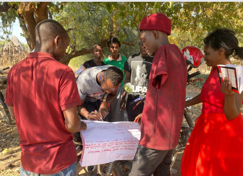
Participants in Mweezya ward, Sinazongwe District engaged in discussions on the challenges faced by people with disabilities and prioritised the most critical barriers.