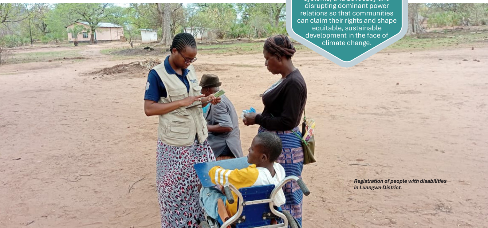
Registration of people with disabilities in Luangwa District.