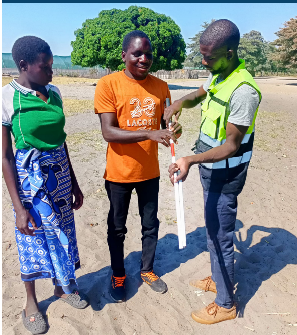
Project field officer handing over a white can to a beneficiary with visual impairment in State Ranch Ward, Shangombo District