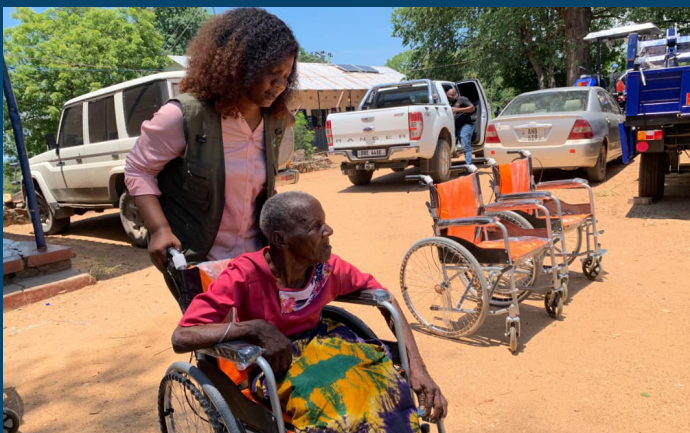
CJC distributes assistive devices in partnership with the Zambia Agency for Persons with Disabilities (ZAPD) in Sinazongwe