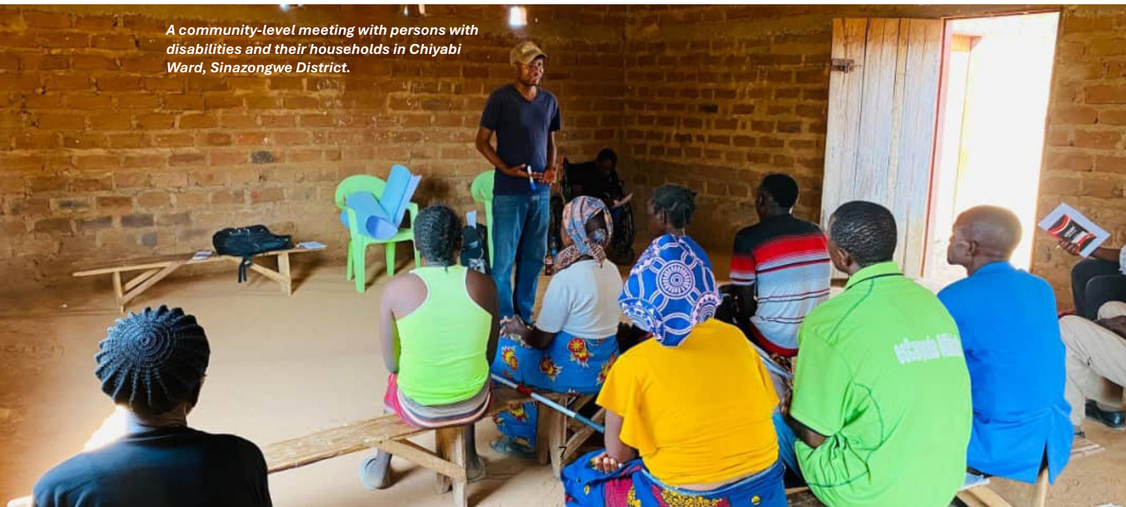
A community-level meeting with persons with disabilities and their households in Chiyabi Ward, Sinazongwe District.