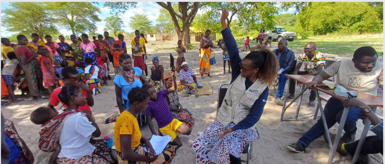
Registration exercise for people with disabilities in partnership with the Zambia Agency for Persons with Disabilities (ZAPD) in Sioma District

Conceptual Framework: The paper draws on Gender Equality, Disability and Social Inclusion (GEDSI) principles, the twin-track approach (mainstreaming and targeted support), intersectionality, and inclusive locally led adaptation principles. These frameworks emphasise community-driven, rights-based strategies that dismantle barriers and promote meaningful participation and sustainable change.