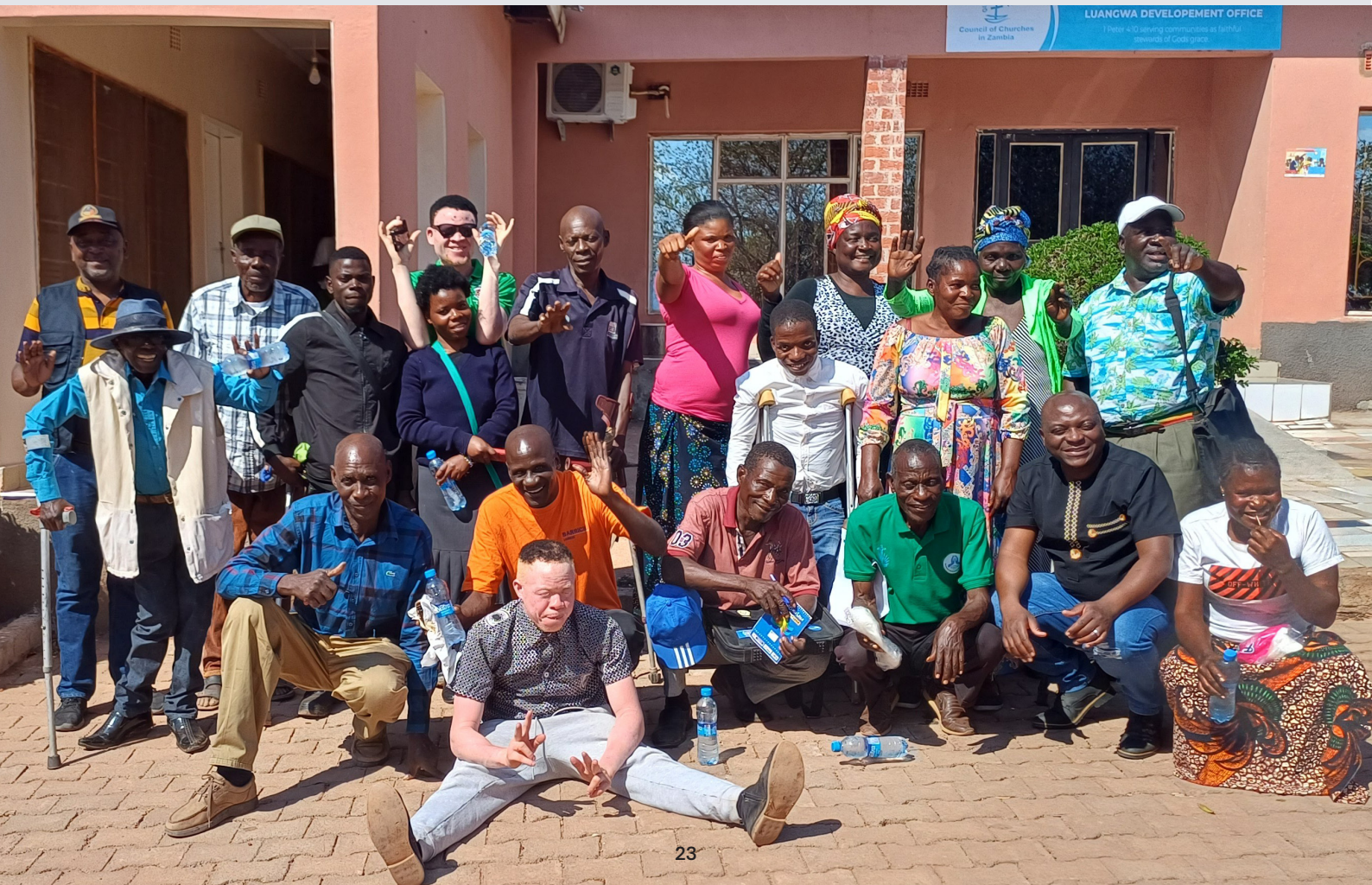
Participants after an OPD strengthening meeting, Luangwa District.