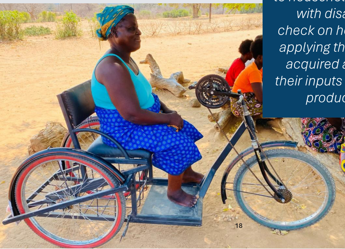
Assistive device enables woman with a disability to be part of community meetings in Sinazongwe

“There was little effort to make specific follow-ups to households of persons with disabilities to check on how they were applying the knowledge acquired and utilising their inputs to boost their productivity” 22