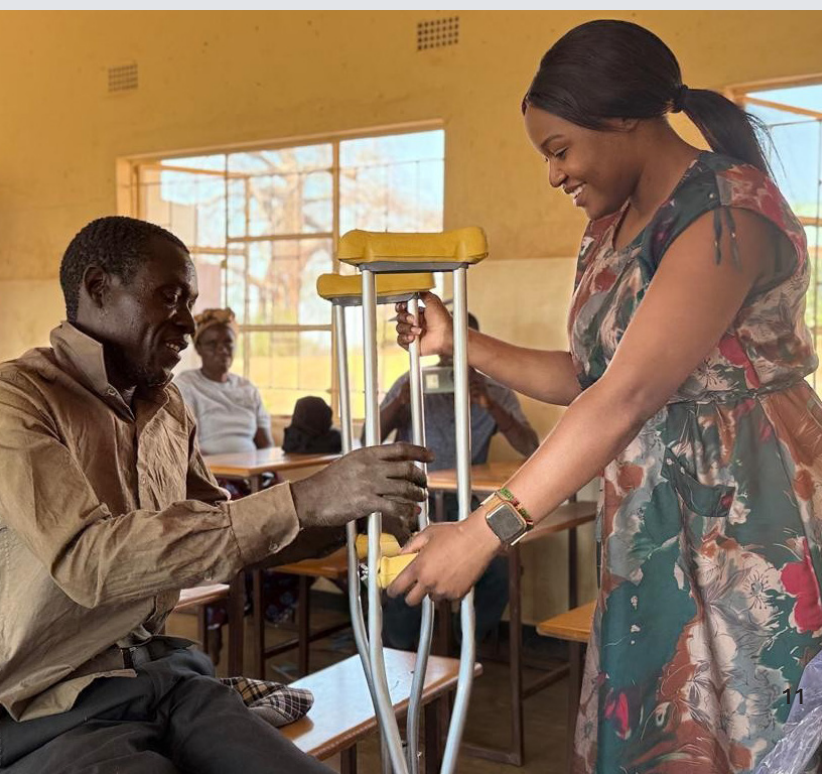
A community member being provided with a pair of crutches to improve mobility and support independent living, Mandombe ward, Luangwa District

Community Management Committee representative, CMC member