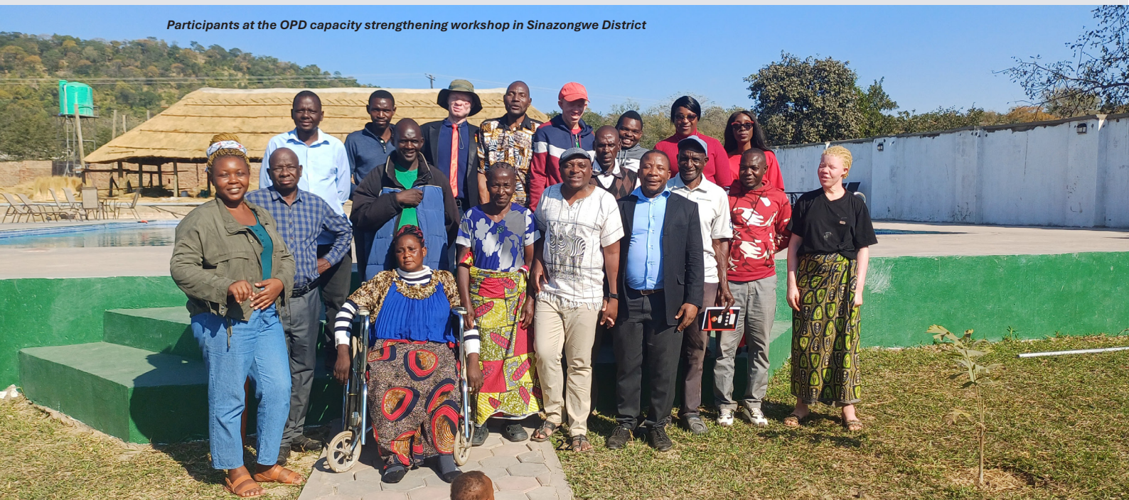
Participants at the OPD capacity strengthening workshop in Sinazongwe District