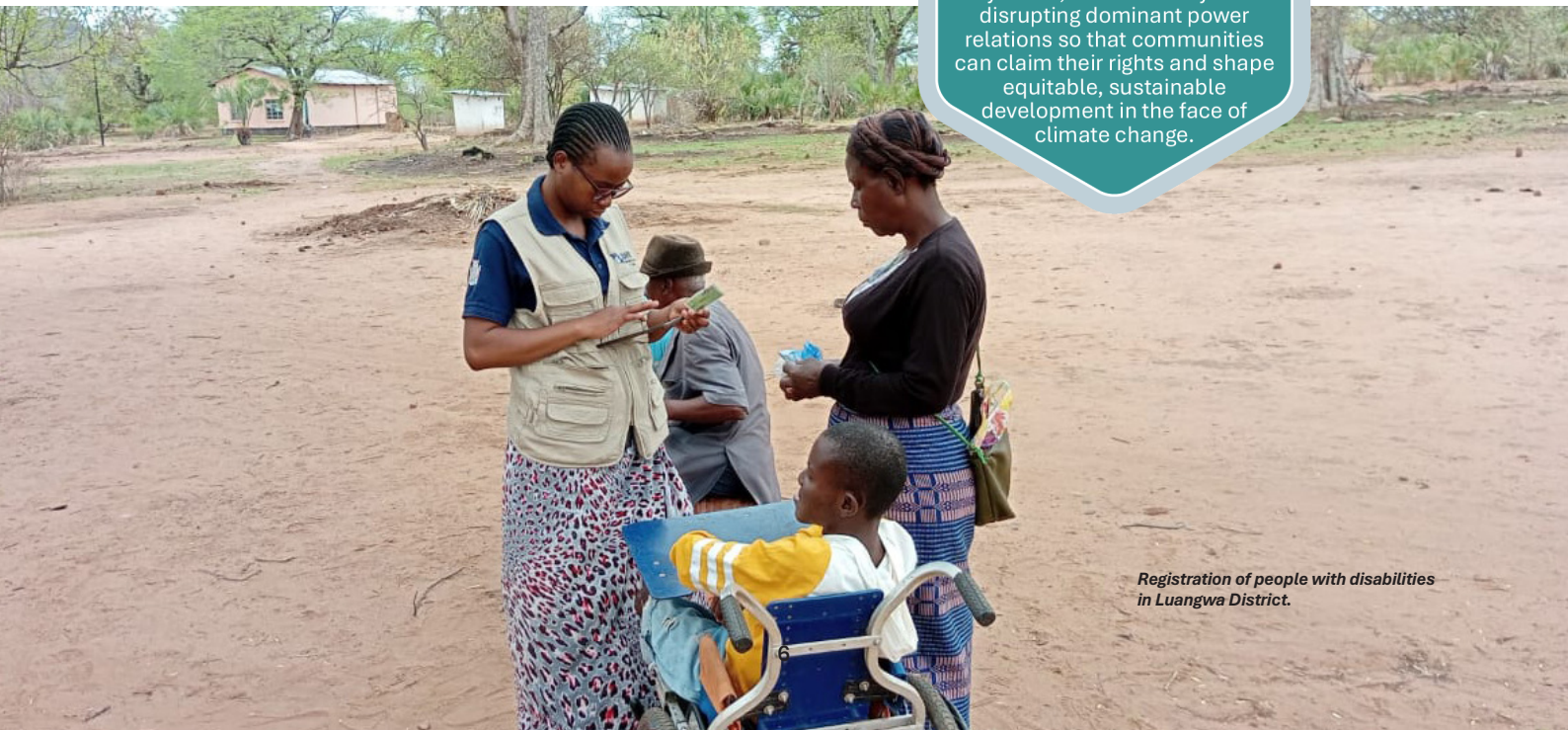
Registration of people with disabilities in Luangwa District.