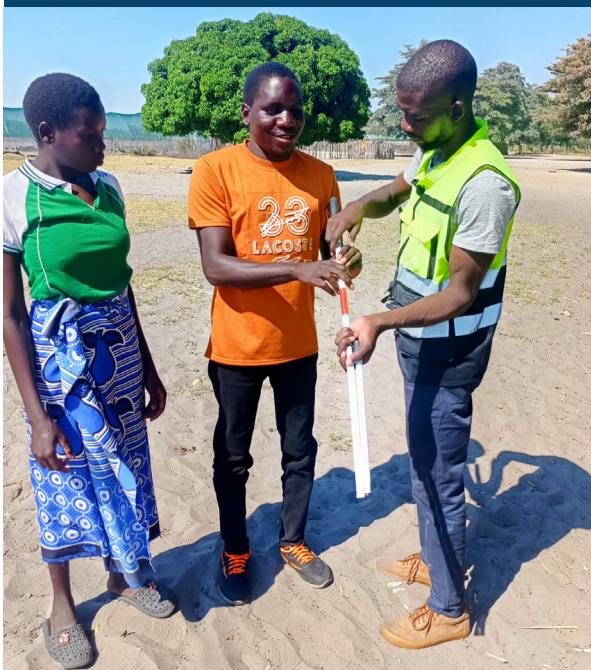
Project field officer handing over a white can to a beneficiary with visual impairment in State Ranch Ward, Shangombo District