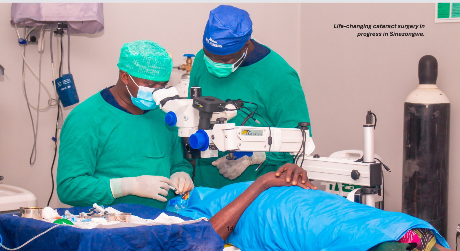
Life-changing cataract surgery in progress in Sinazongwe.