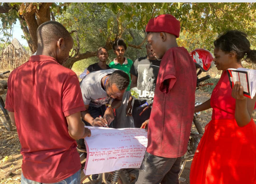
Participants in Mweezya ward, Sinazongwe District engaged in discussions on the challenges faced by people with disabilities and prioritised the most critical barriers.